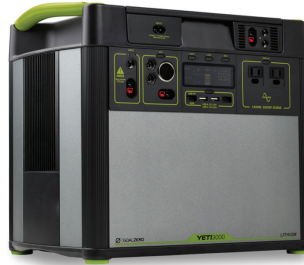
Portable Backup Battery

Get a free , clean-energy backup battery to operate your medical device during an outage.